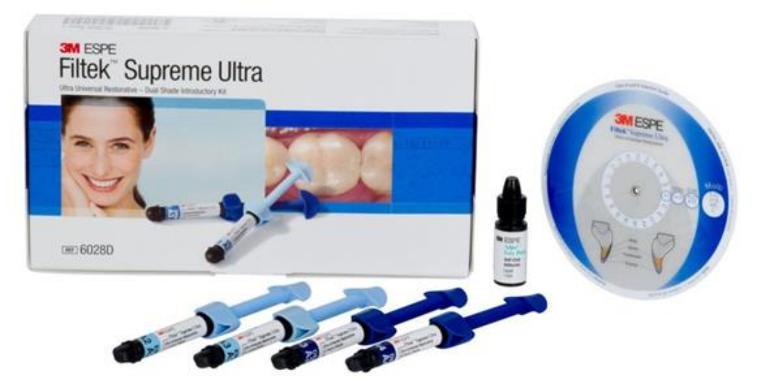
Figure 1. Filtek Supreme nanocomposite

human biological systems at the molecular level engineered nanoparticles and using nanotechnology. The creation of nanomedicine is a matter of the near future; it does not exist yet, but there are rapidly developing technologies that allow us to create unique devices and applications that open up new opportunities and directions in various areas of modern medicine. The global dental community was introduced to the "nanoworld" in autumn 2002 when the first composite material of the new generation, Filtek Supreme nanocomposite, was presented at the International Dental Exhibition in Vienna (Fig. 1). A high degree of filling combined with abrasive wear resistance, good polishability and high aesthetics allowed this subfamily of composites to become a standard restorative material and complete the evolution of inorganic filler sizes from macrofilled to nanohybrid.