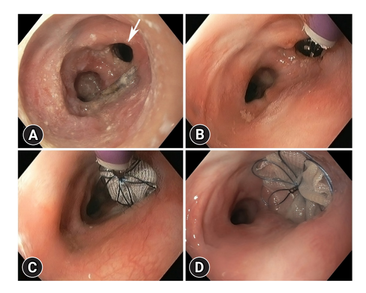
Fig. 1. (A) Image of the large 8-mm esophageal-pleural fistula (arrow) at 5 days before occluder placement. (B) Initiation of opening the occluder from the delivery device. (C) Detachment of the occluder from the delivery device. (D) Successful placement of the atrial septal defect occluder.

Patients with systemic scleroderma tend to have chronic nonhealing wounds due to pathological alterations in the immune